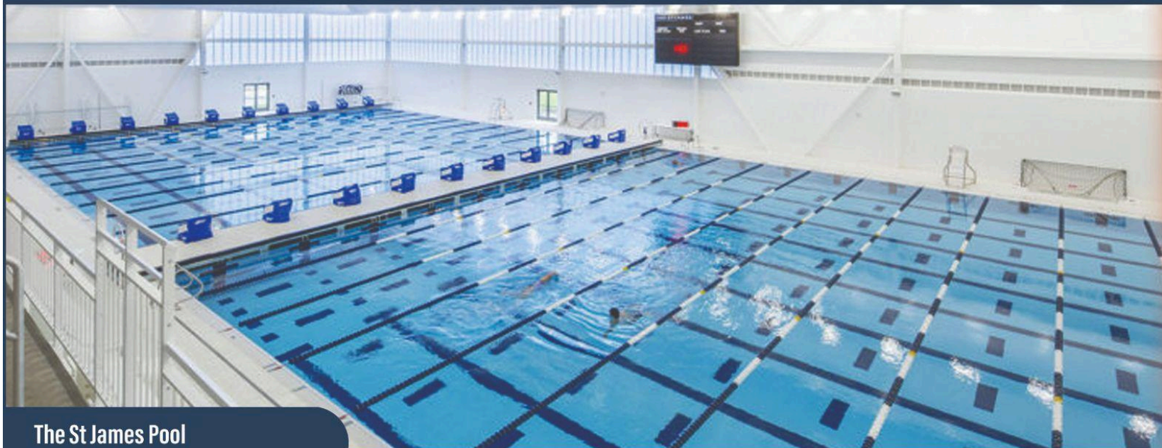
The St James Pool 6805 Industrial Rd, Springfield, VA 22151