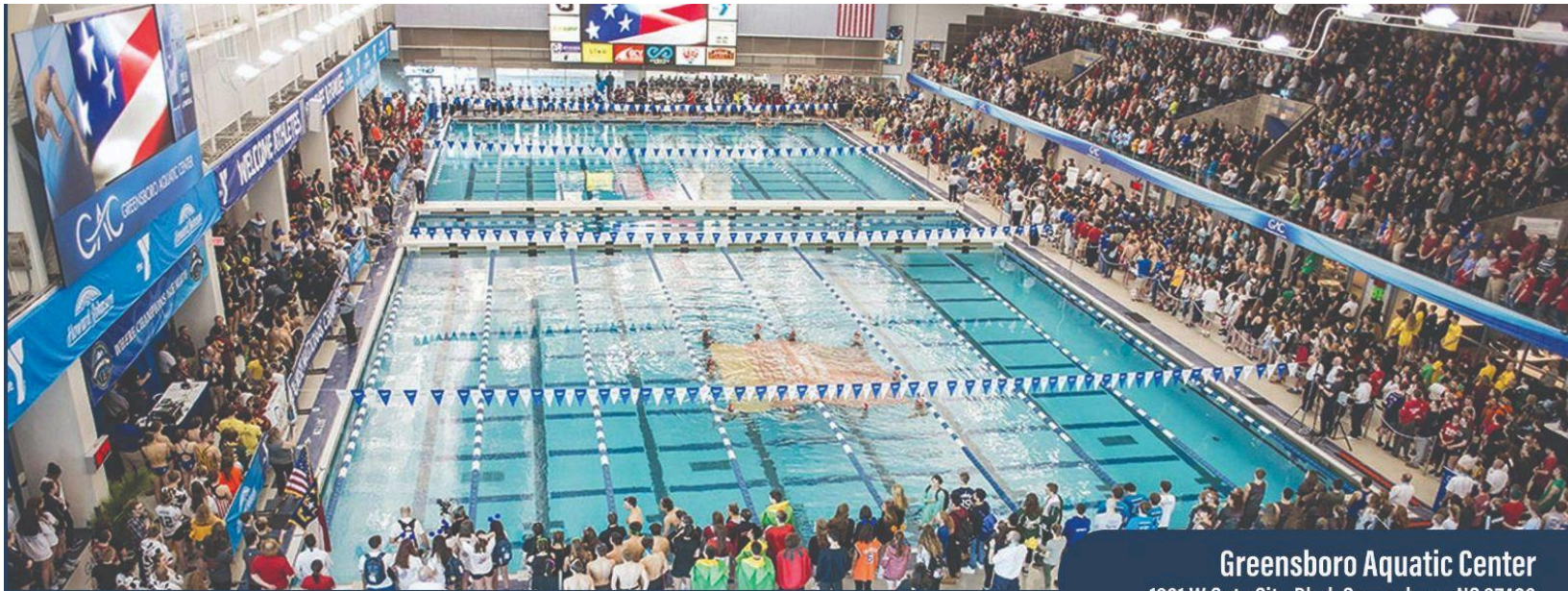
Greensboro Aquatic Center 1921 W Gate City Blvd, Greensboro, NC 27403